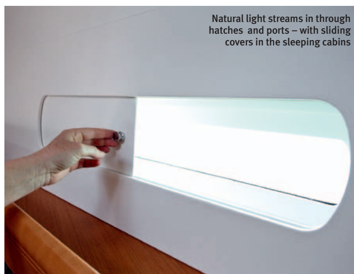
Natural light streams in through hatches and ports – with sliding covers in the sleeping cabins