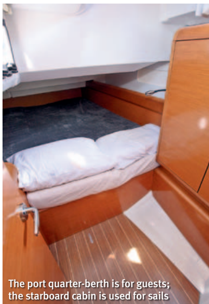
The port quarter-berth is for guests; the starboard cabin is used for sails