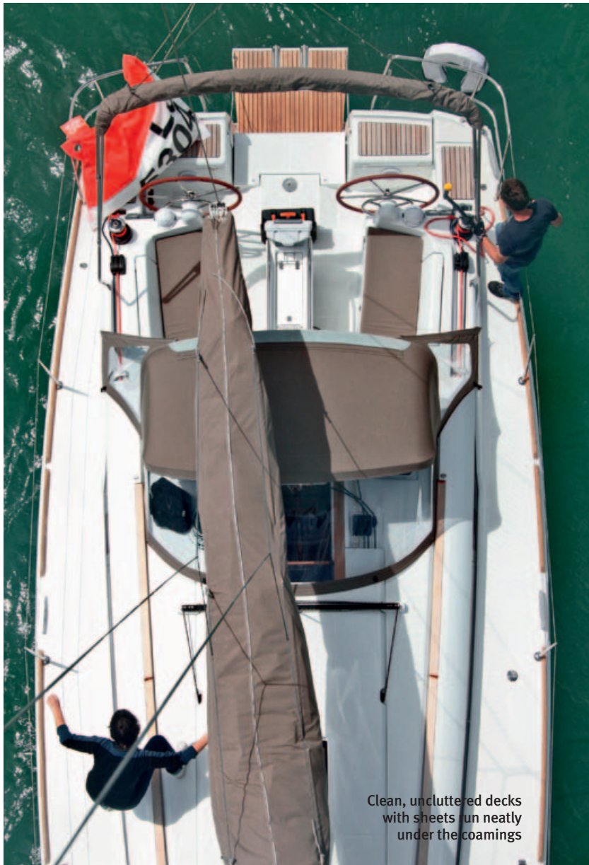
Clean, uncluttered decks with sheets run neatly under the coamings