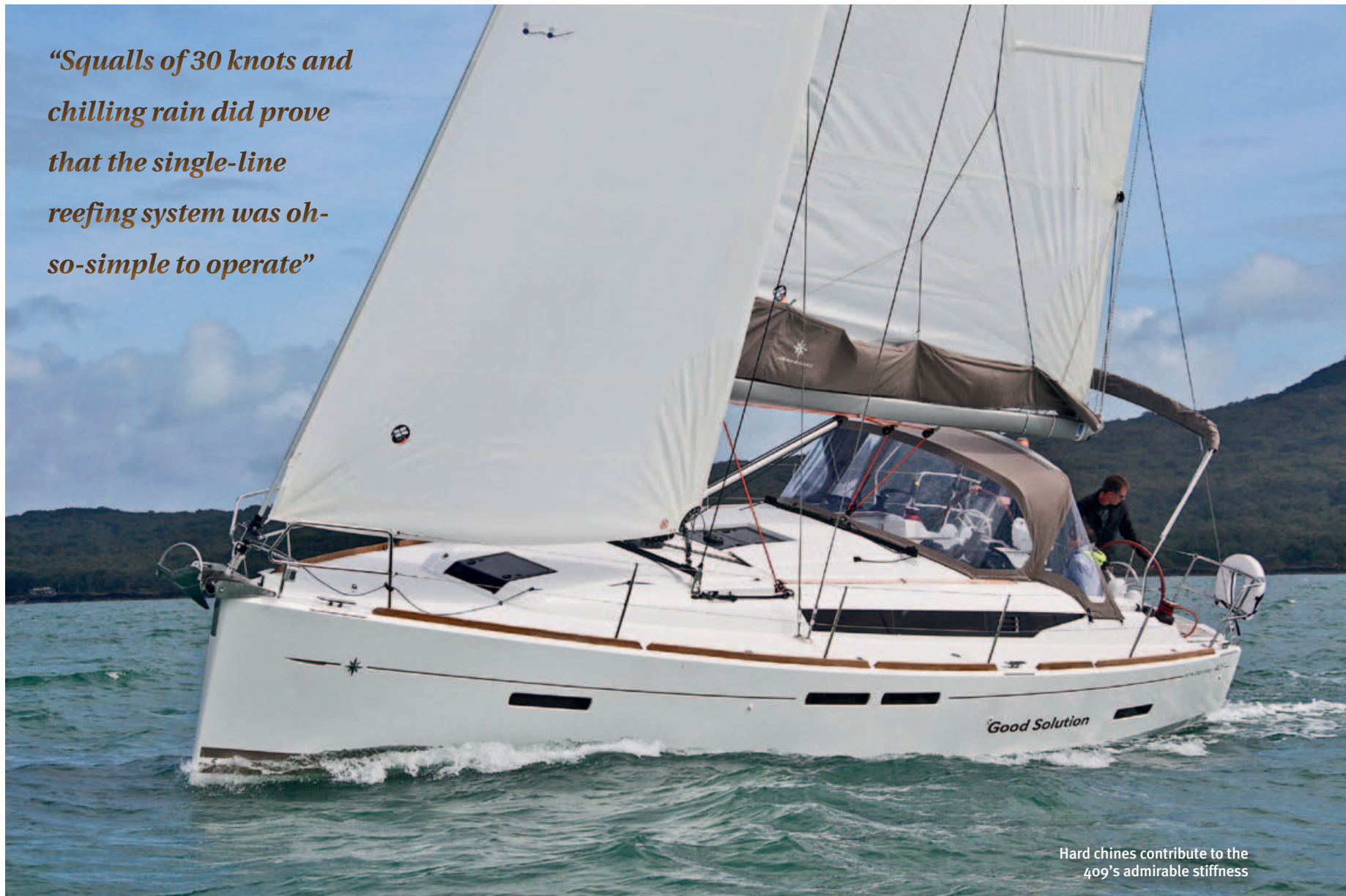
Hard chines contribute to the 409's admirable stiffness

“Squalls of 30 knots and chilling rain did prove that the single-line reefing system was oh-so-simple to operate”