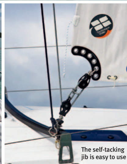
The self-tacking jib is easy to use