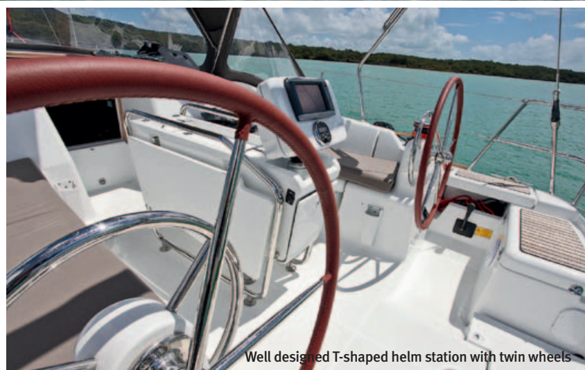
Well designed T-shaped helm station with twin wheels

The Yanmar 40hp saildrive spins a three-bladed Gori prop with overdrive,