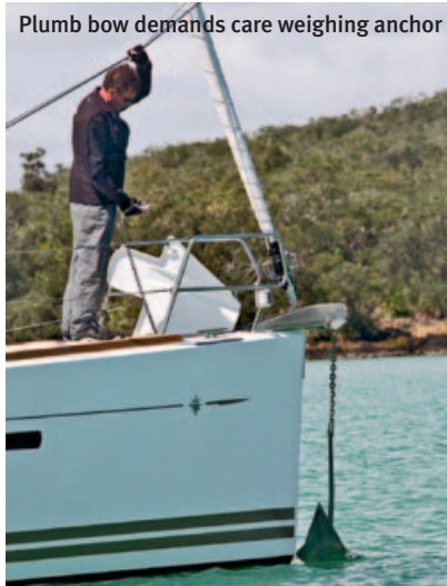
Plumb bow demands care weighing anchor

been available for powerboats for about a decade, but now yachts can go sideways too. The cockpit is standard T-shaped with twin helmstations. The swim platform with folding ladder lowers manually for easy boarding from the marina or the water. A dedicated slot in the transom stows the washboards; we like that.