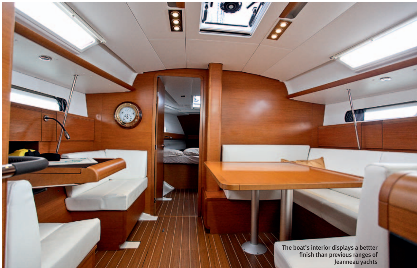
The boat's interior displays a better finish than previous ranges of Jeanneau yachts