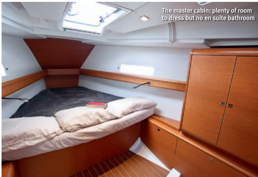
The master cabin: plenty of room to dress but no en suite bathroom