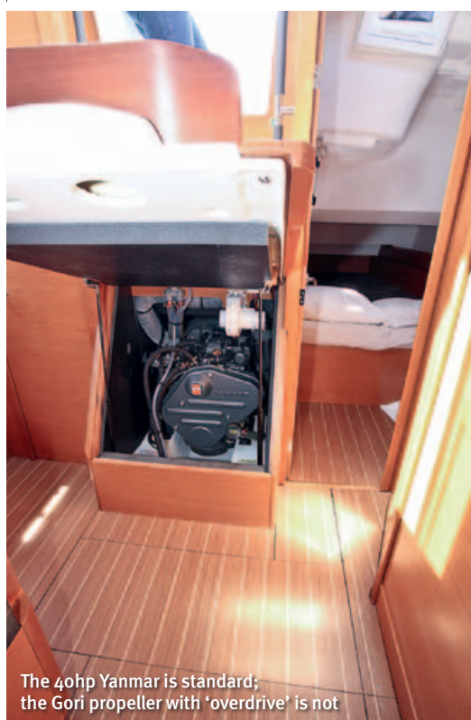
The 40hp Yanmar is standard; the Gori propeller with 'overdrive' is not