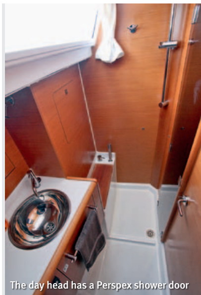
The day head has a Perspex shower door

tight two-seater with chart table between, which could double as a coffee table or even dining for two. The day head has a Perspex shower door to keep spray off the toilet and towels. The hot water cylinder heats from the motor or 240V shore power. The saloon table is to starboard, separated from the galley by a low Perspex screen.